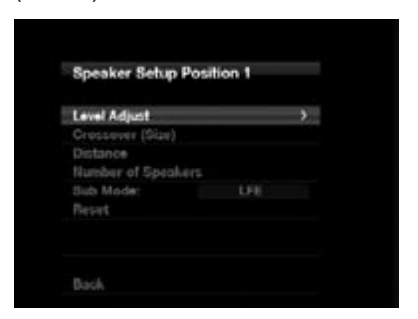
Figure 28 - Speaker Setup Position Menu

If you have run the EzSet/EQ II process, the results were saved in one of the two listening positions (AVR 760 position 1+2, AVR 660 1 position). Adjust the Speaker Setup setting in the Audio Effects menu to activate the results for either position (AVR 660: 1 position) (see page 26-27 in the Basic Manual). To tweak the EzSet/EQ II results, or to configure the AVR from scratch, select Setup Listening Position 1 (AVR 760, AVR 660) or Setup Listening Position 2 (AVR 760). A screen similar to the one shown in Figure 28 will appear.